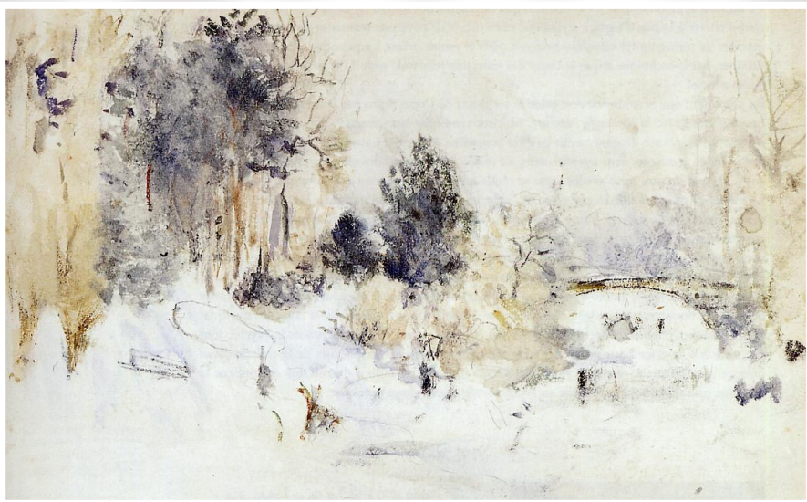
Berthe Morisot, Snowy Landscape

Written for Trio Morisot, Snowy Landscape was inspired by Berthe Morisot's 1880 impressionistic watercolor "Paysage de neige". The music depicts the icy and bleak scenery with harmonics on the strings and bare open fifths on the piano at the beginning. The violin and cello enter with expressive lyrical melodic lines on top of a chain of broken figurations of the piano, which turns into a more rhythmic, chordal, tense and passionate middle section, which is later followed by a melancholic passage bringing back the opening icy and bleak mood. This piece was commissioned by Jasper Rouge Limited for Trio Morisot in 2016 with sponsorship from CASH Music Fund.