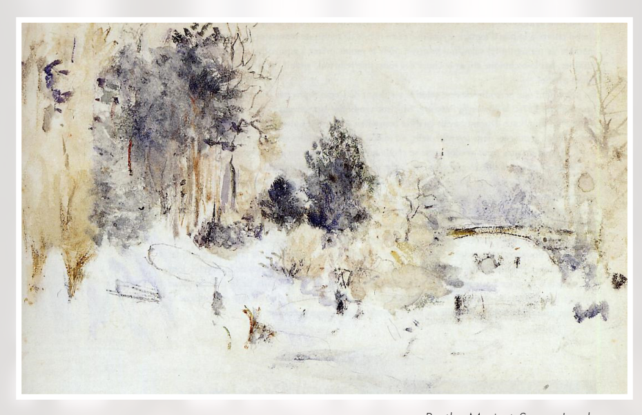
Berthe Morisot, Snowy Landscape

Written for Trio Morisot, Snowy Landscape was inspired by Berthe Morisot's 1880 impressionistic watercolor "Paysgae de neige". The music depicts the icy and bleak scenery with harmonics on the strings and bare open fifths on the piano at the beginning. The violin and cello enter with expressive lyrical melodic lines on top of a chain of broken figurations of the piano, which turns into a more rhythmic, chordal, tense and passionate middle section, which is later followed by a melancholic passage bringing back the opening icy and bleak mood. This piece was commissioned by Jasper Rouge Limited for Trio Morisot in 2016 with sponsorship from CASH Music Fund.